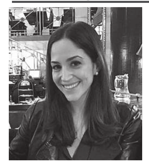
Dear fellow Alpha Omegans,

It has been less than two months since I sat down to write my letter for the previous edition of the AORTA, yet it truly feels like a lifetime ago.