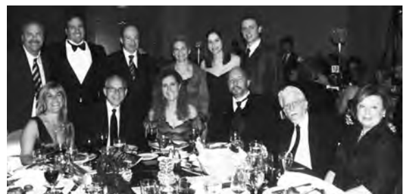
Honoured AO members